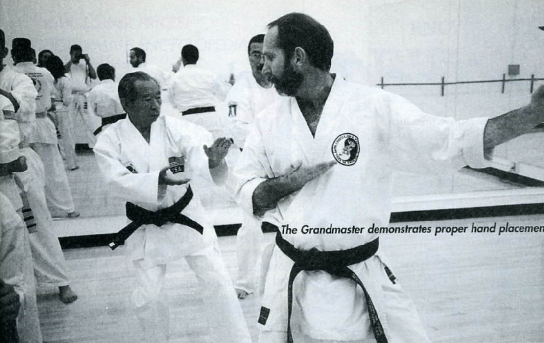
The Grandmaster demonstrates proper hand placement and balance while teaching class